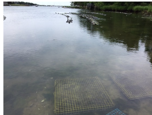
Floating Bags and Trays