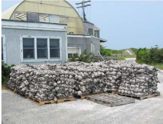
Remote Set Bags