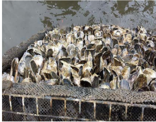
Grow-out in Trays