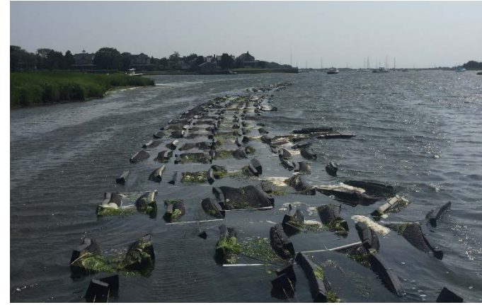
Grow-out in Floating Bags