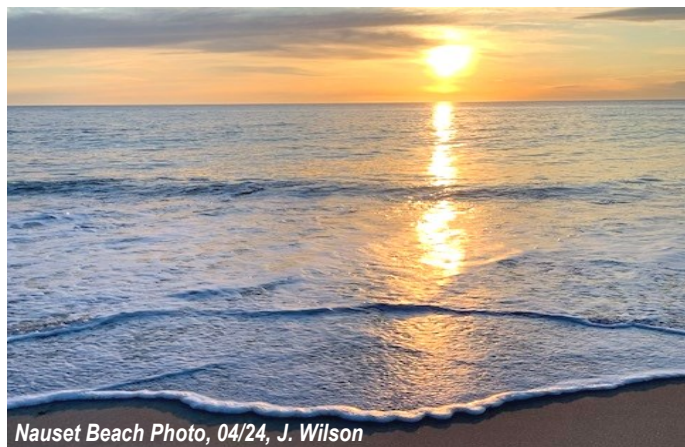
Nauset Beach

This group for individuals with visual impairments is coordinated by Sight Loss Services. In-person meetings occur monthly at the Eastham Senior Center. Please call Sight Loss Services at 508-394-3904 for additional information.